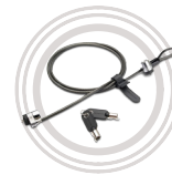
Kensington® MicroSaver® Security Cable Lock by Lenovo™ Ultra protection against thieves