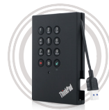
ThinkPad® USB 3.0 Portable Secure Hard Drive Fast & Secure