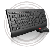
Lenovo™ Ultralim Wireless Keyboard and Mouse Combo Fast & Fluid